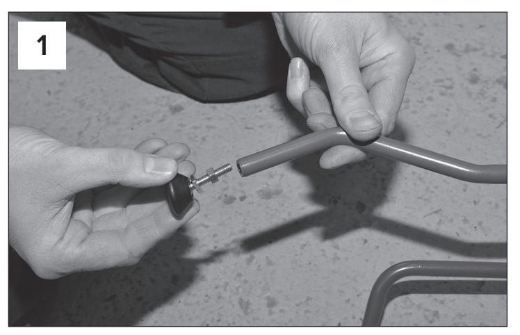
Insert rubber feet into bracket.