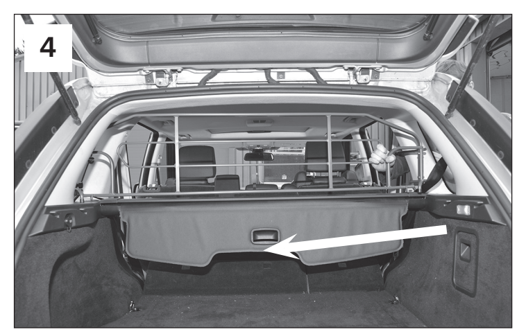
Lower rear seats and insert the dog guard.