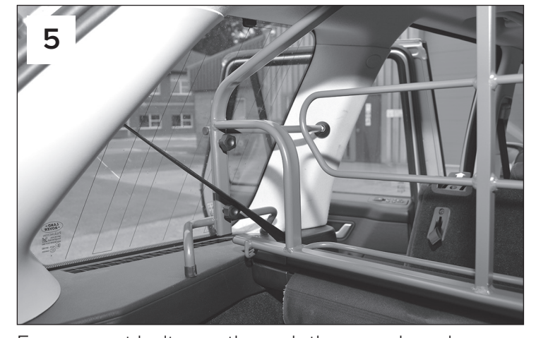
Ensure seat belt runs through the guard as shown. Tighten rubber feet.