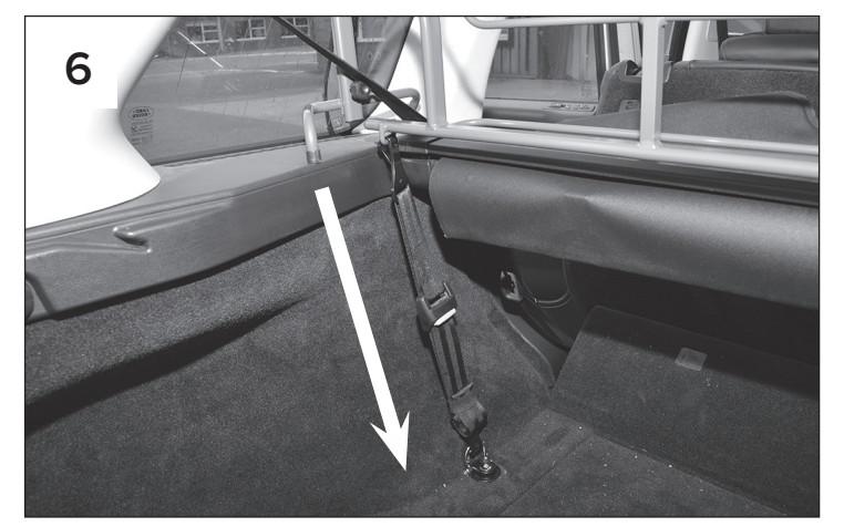
With guard in place, clip the securing belt into place and pull the belt to tighten.