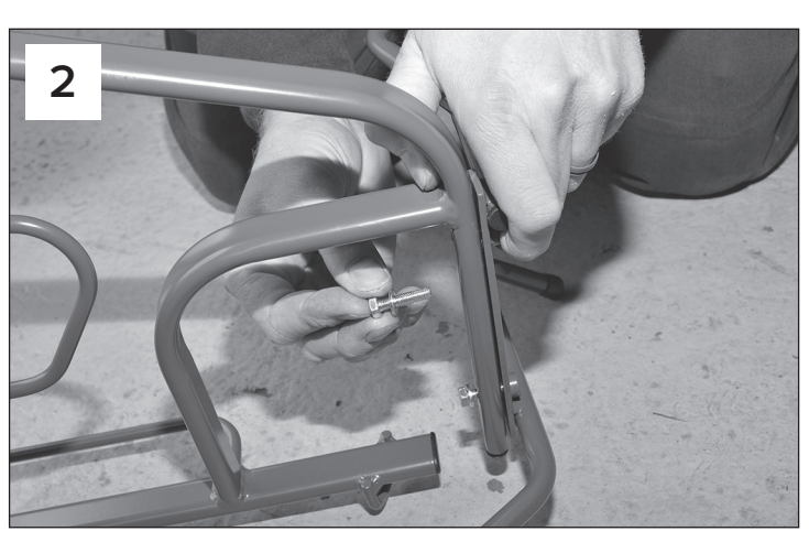
Secure bracket with bolts and tighten with 10mm spanner.