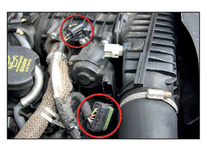
Butterfly valve connector (lower) and air box connector (upper)

Now unplug the EGR butterfly valve actuator and air box connectors.