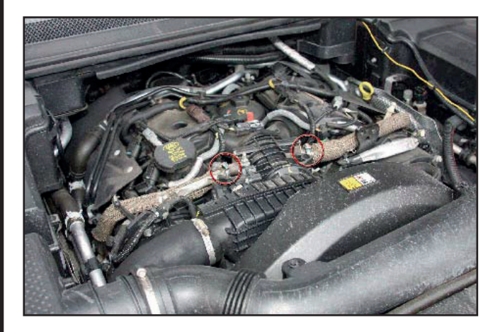
EGR pipe clamps

Using a suitable screwdriver, unclip the EGR pipe clamps either side of the EGR butterfly housing. Insert the screwdriver under the little clip across the top of the clamp and twist. Later on we'll be removing the stub pipes and flanges from the butterfly housing when the bolts are easier to get to.