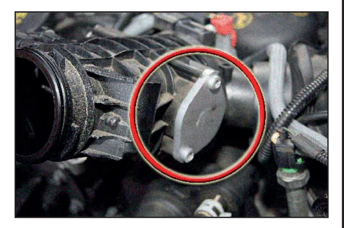
Stub pipe blank fitted.

These stub-pipes also present quite a large obstruction to the air flow to the engine. When fitted, they meet in the middle of the air intake duct. The engine will be able to breathe much more freely now they are out! Fit 2 O-ring seals to each of the 2 blanks from the kit, and then fit each blank to the butterfly housing, securing them with the TORX screws. Again, don't over tighten them — you are screwing them into plastic don't forget!