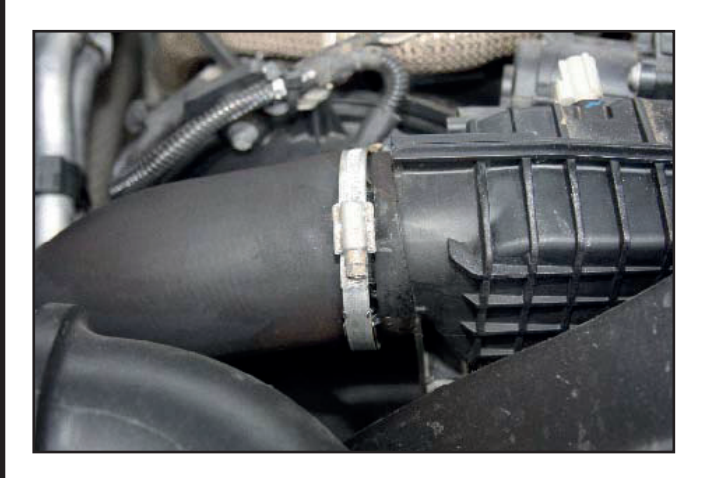
Air inlet pipe to air box jubilee clip

Loosen the jubilee clip securing the air inlet pipe to the right hand side of the air box then disconnect the pipe from the air box. Note . The jubilee clip is secured to the pipe with some sort of retaining clip and will not slide down the pipe so just loosen it enough to clear the lip on the air box allowing you to remove the pipe.