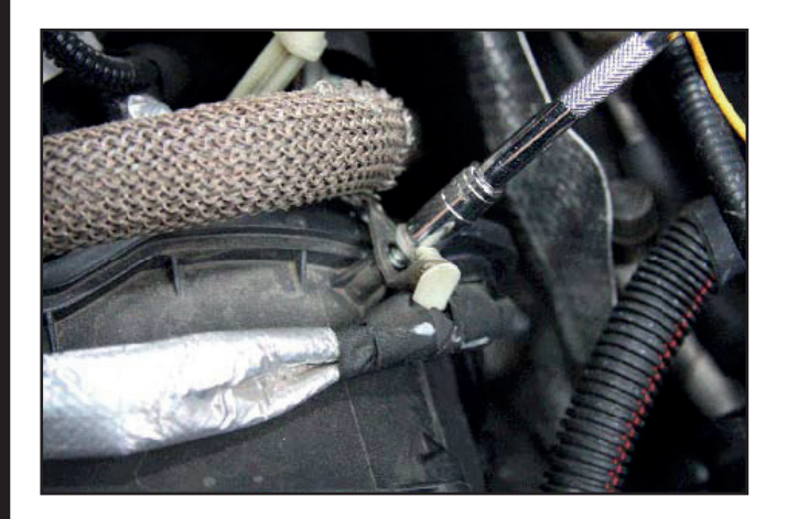
Left hand EGR pipe bracket

Remove the 8mm bolts securing the right and left hand EGR brackets to the plastic casings. Note. This is the left hand bracket.