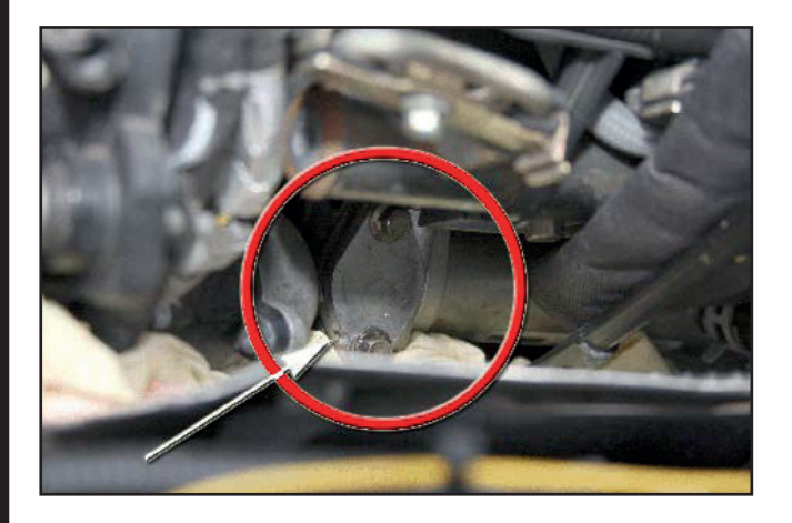
EGR valve blank fitted - indent arrowed!

Once you have fitted both blanking plates, whatever you do, don't forget to remove the rags you stuffed down beside the valves.