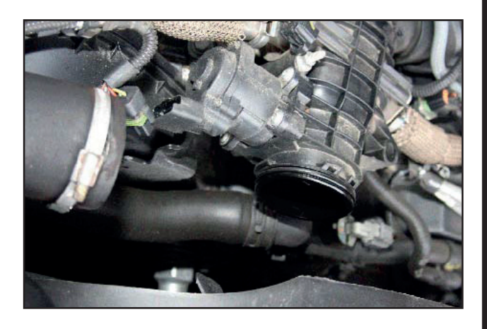
Air box removed

Warning . From now on, take great care not to drop anything into the now open EGR butterfly housing. If anything ends up in there and the engine is started, severe damage is likely to result. Not only that, be very careful where you put the air box – you may not notice if anything falls into it.