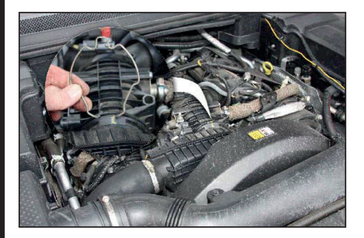
Air box to EGR butterfly housing securing clip

Have a good look at the clip securing the air box to the EGR butterfly valve housing to see how it's fitted and make a note (mental or otherwise) of this. Now remove the clip. You can do this by inserting a screwdriver in the upper looped part of the clip and twisting.