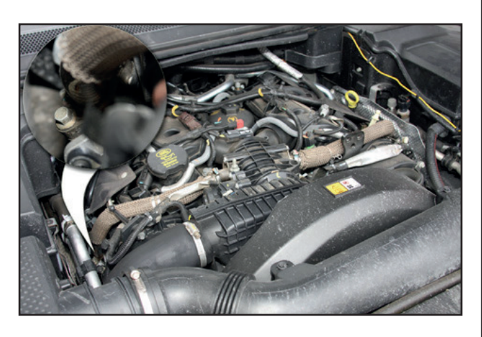
View of engine with top cover removed – right hand EGR valve shown in inset

Refit the oil filler cap – you don't want to drop anything down there while you work!