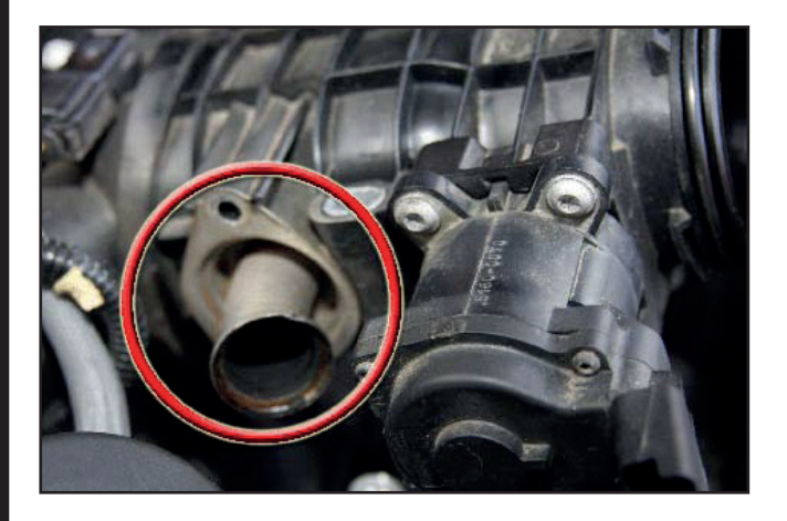
Removing the stub pipes. Remove the TORX screws and pull the pipes out. The O-ring seals might get left behind in the housing – dig them out as well.

Here's a picture of one of the stub pipes.