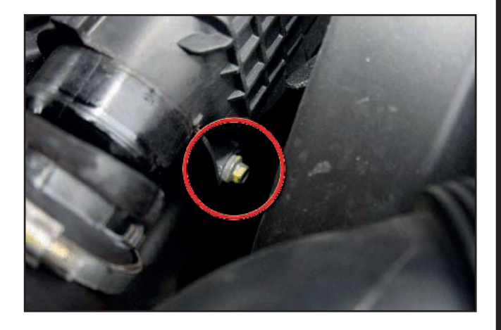
Air box lower bolt

Note . Be careful here. This bolt is fairly long and although it can probably be removed completely, to do so means pulling it forward into the cooling fan blades. There's not a lot of room and I felt that I would probably drop it so I held it in place with my fingers so it came away with the air box.