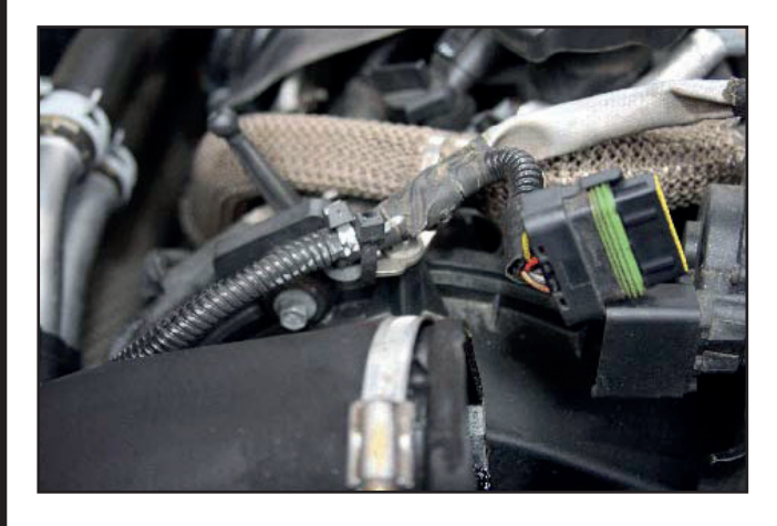
Tie-wraps - right hand EGR pipe bracket

Remove the 8mm bolts securing the right and left hand EGR brackets to the plastic casings. Note. This is the left hand bracket.